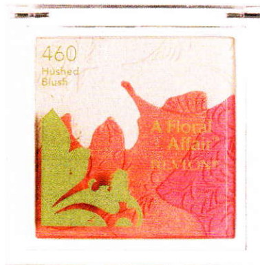
REVLON A FLORAL AFFAIR SHEER POWDER BLUSH IN HUSHED BLUSH $12