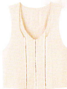
COTTON VEST $1,095, Stella McCartney, 212-255-1556